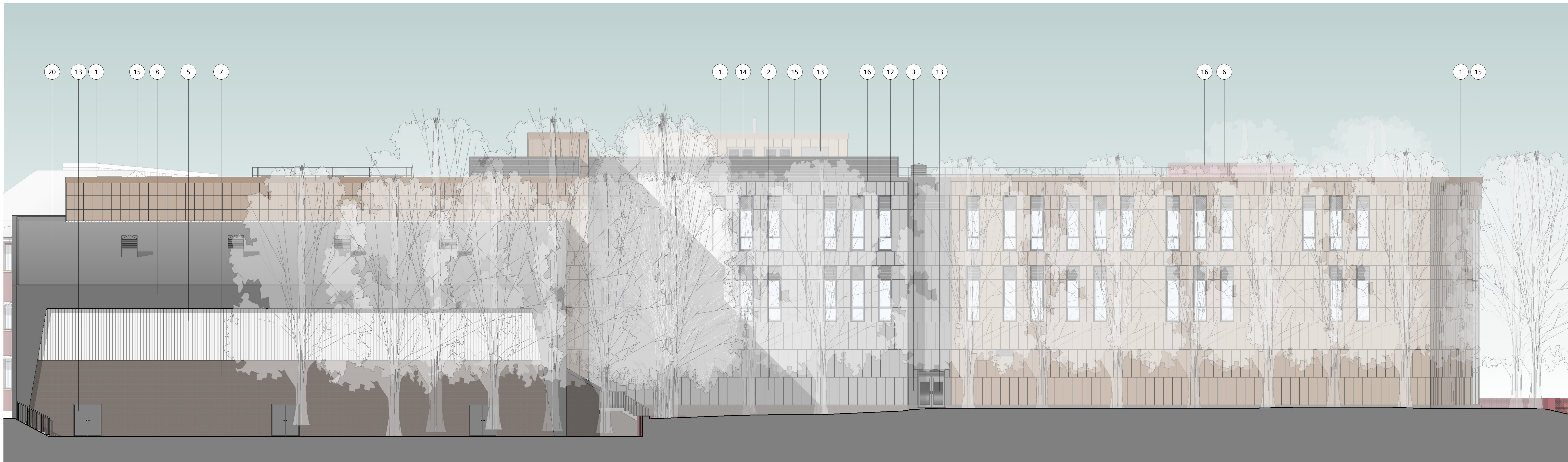
Library Car Park / South Elevation 1 : 100